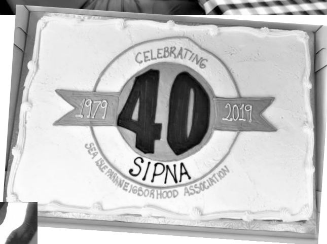
Can't have a party without CAKE!