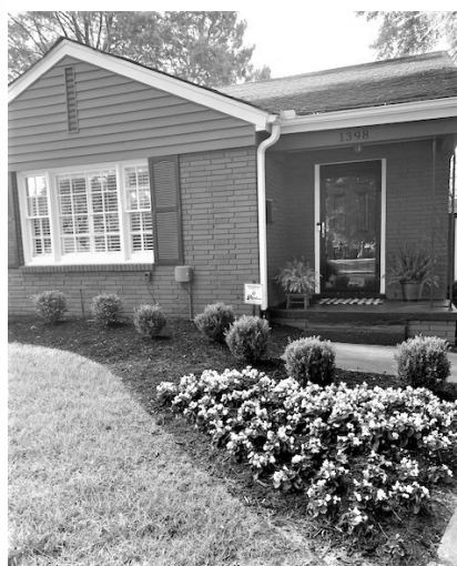
JUNE Wheaton St.